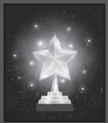
SHOU CHIANG TAN*